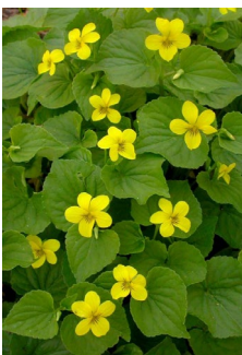
Pioneer Violet Ben Legler

Keep the area around your newly planted perennials free of weeds. Water about once a week during the first one to two summers, and after that as needed. Watering frequency will depend on the weather. There is a good chance the perennials will bloom the first year.